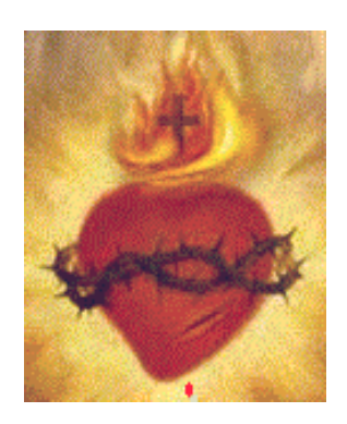
"Sacred Heart of Jesus: Abundance of Love and Mercy"