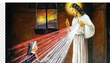
Sister Faustyna's vision of JESUS