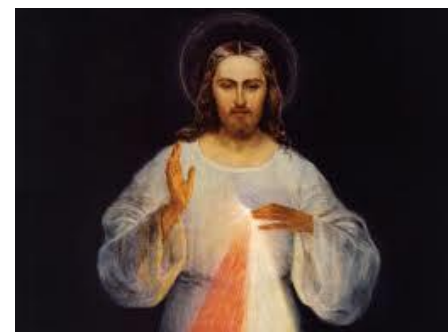
JESUS, I TRUST IN YOU