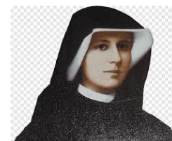
Sister Maria Faustyna